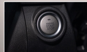
SMART KEYLESS ENTRY & PUSH START BUTTON.