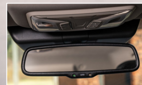
AUTO-DIMMING MIRROR & DASHCAM POWER OUTLET.