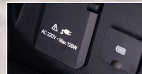
120 WATT 220V INTERIOR POWER OUTLET.

ACC automatically adjusts the vehicle speed to maintain a safe following distance.