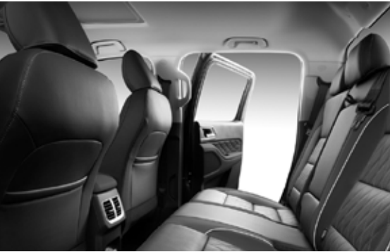
▲ Rear seats^