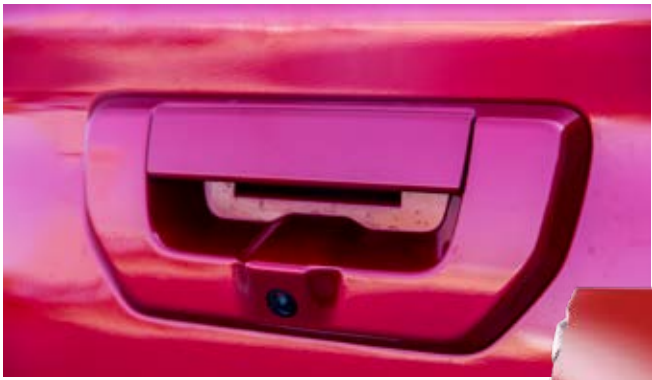
▲ Reversing camera