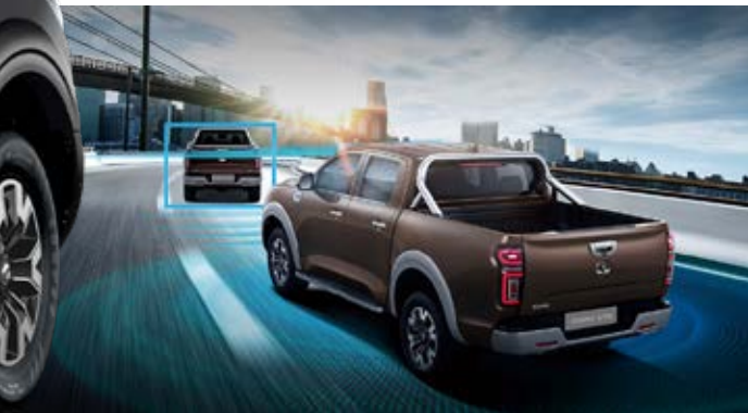
▲ 360 view camera, FCW+AEB, Lane Change Assist & Lane Departure Warning^