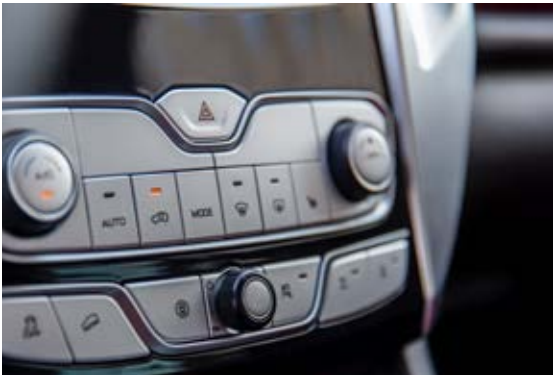
^ Overseas model shown. Specifications may vary.