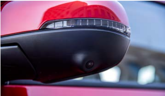
▲ Curbside camera

The GWM Ute was born to tackle the toughest jobs but it was also built smart with a full suite of comprehensive safety systems designed to protect occupants and other road users.