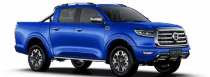
Cannon L & X