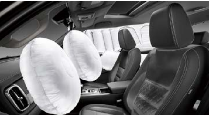
▲ Front, side, centre and curtain airbags ^