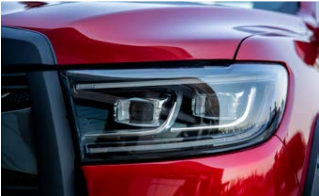
▲ LED headlights with daytime running lights